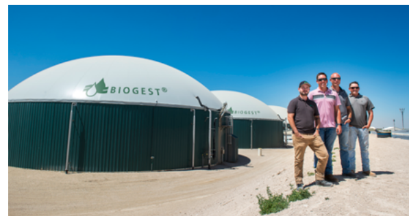
Picture: BIOGEST® PowerDigest biomethane plant, 184,000 MMBTU/year (585 Nm 3 /h), Oak Valley, South Dakota, US

BIOGEST has completed more than 180 projects on 3 continents and is able to provide tailored service due to its highly qualified international team. With more than 30 years of experience in the AD sector, we have optimized the process design of our plants to guarantee simple operation while achieving high reliability.